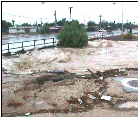
Photo 1 Subsurface Currents Upstream of Submerged Culvert

Safety of detention basins is an increasing concern in urban areas. During a storm event, the subsurface currents in a basin create unseen hazards. As soon as the outfall pipe entrance becomes plugged, the pressure force quickly switches from flow-momentum force to water-weight static force. The vortex flow near the outfall structure presents a pressure force that can cause loss of life. According to the Newton's third law, the pressure force acting on the pipe entrance can also be interpreted as the suction force in the flow direction or into the pipe tube. This paper presents a simple model to quantify the pressure force when the pipe entrance is gradually clogged. Examples illustrated in this paper reveal that the pressure force generated by plugging a pipe can be lethal.