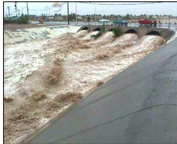
Photo 2 Turbulent Jets and Cross Waves Downstream of Submerged Culvert