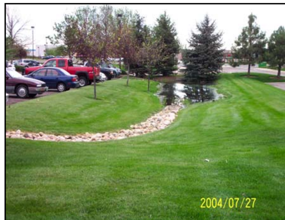
Photo 1 Storm Water Detention Basins